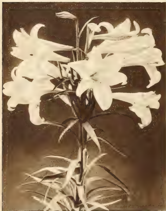
BERMUDA EASTER LILY

Extra Size Bulbs, 7 to 9 inch. (Packed weight 2½ lbs. doz.) 50c. ea.; $5.00 doz.; $37.50 per 100.